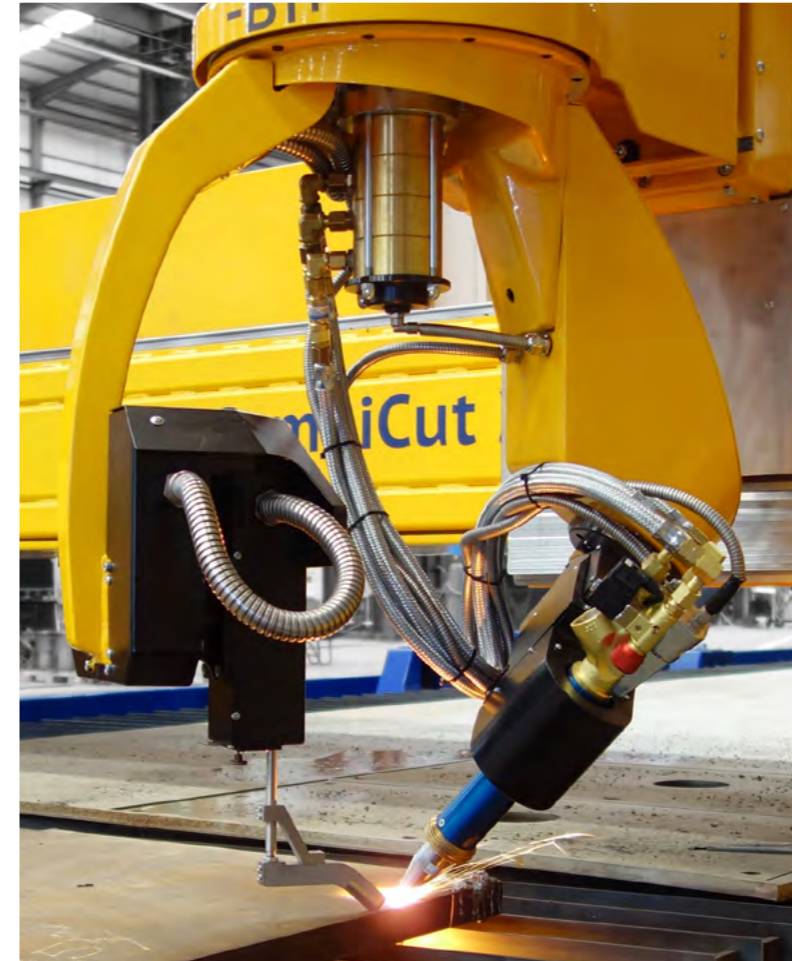
Bevel cutting with oxyfuel rotator