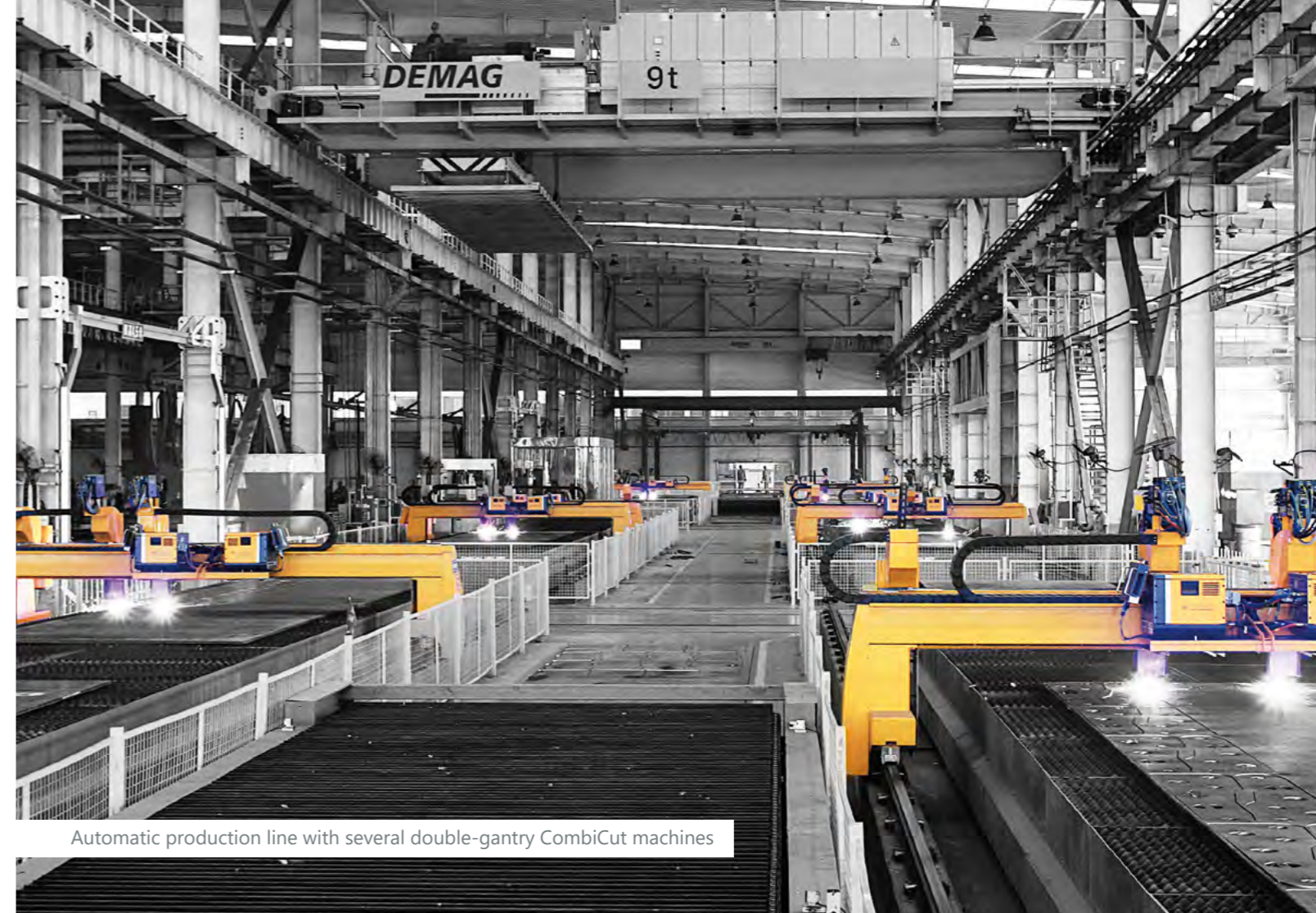
Automatic production line with several double-gantry CombiCut machines